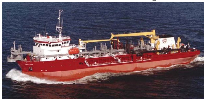
Hopper Dredge Liberty Island

A $12.23m contract with Great Lakes Dock & Dredge Co. of Chicago for the dredging and placement of nearly 1m cubic yards of sand will be considered by the BCC on January 13. The tentative construction start date is early February and work must be completed by April 30. See www.pbcgov.org/erm/coastal/shoreline/pdf/Juno-Renourishment_12-23-08.pdf for more information.