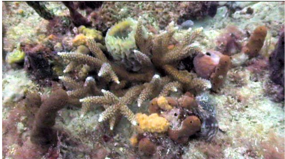
Staghorn Coral on Gulfstream Reef.

The Reef Research Team surveyed two areas of Gulfstream Reef to document the staghorn coral, Acropora cervicornis , colonies reported by local divers. This coral has recently been listed as a "threatened" species by the Endangered Species Act.